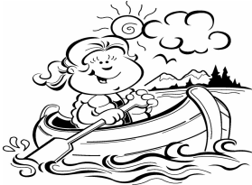
OLD MILL CAMP NEWS